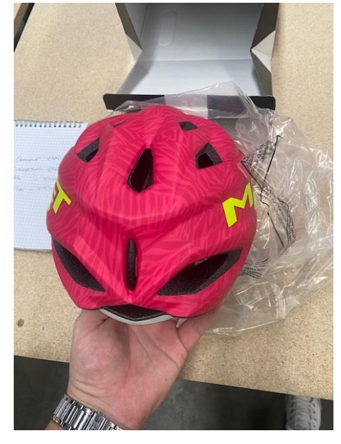
1) Remove helmet from carton & protective bag.

Be careful not to place the helmet on a surface that may scratch or damage it.