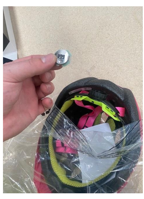
3) Remove the battery & dispose of the light cell.

If it's a tight fit, you may need to use a small flat head screwdriver to gently remove the cap, taking care not to damage it.