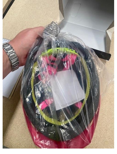
3) Re-pack the helmet for sale.

Line up the mounting points and push down firm.